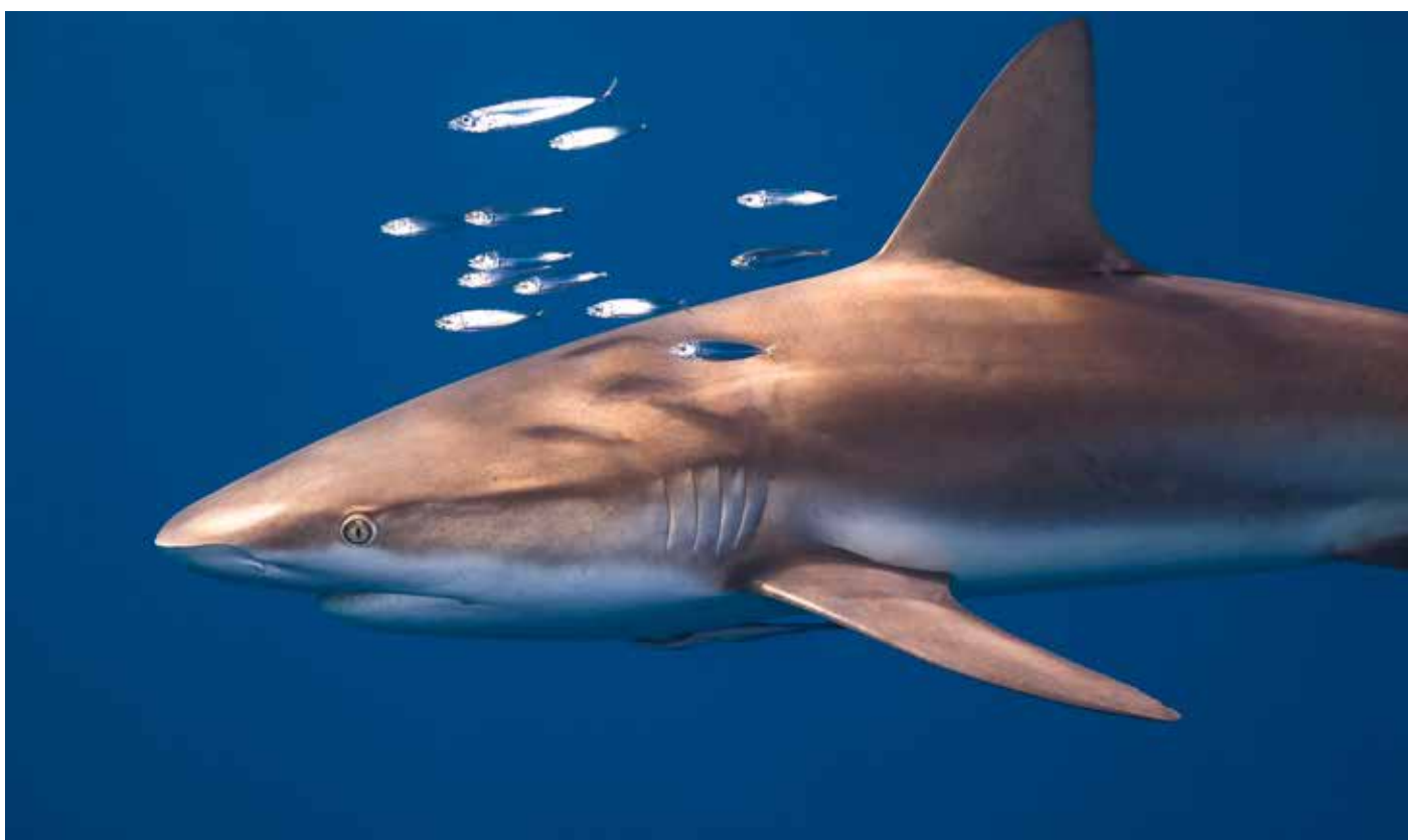
Silky Shark, Cuba.

Bahamas, Bangladesh, Benin, Brazil, Burkina Faso, the Comoros, the Dominican Republic, Egypt, the European Union, Fiji, Gabon, Ghana, Guinea, Guinea-Bissau, Maldives, Mauritania, Palau, Panama, Samoa, Senegal, Sri Lanka and Ukraine.