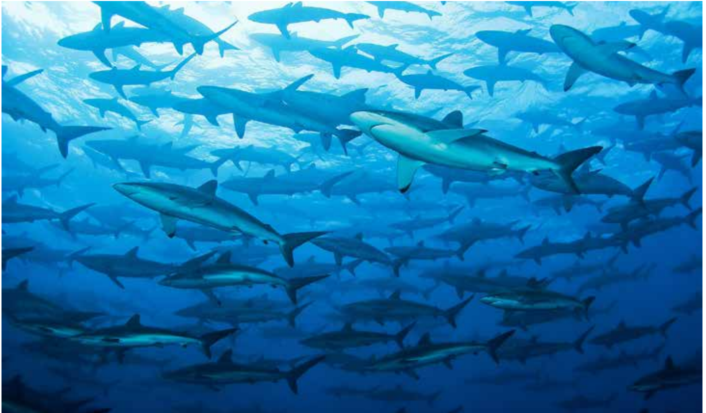
Silky shark school. ( Carcharhinus falciformis )

IUCN and TRAFFIC conclude that “it would appear therefore that the silky shark meets the criteria for inclusion in Appendix II in Annex 2 a of Res. Conf. 9.24 (Rev. CoP16), in that regulation of harvest for trade is required to ensure that the species is not reducing the population to a level at which it becomes threatened.” TRAFFIC recommends CITES Parties accept the silky shark listing proposal, as inclusion in Appendix II can serve as a much-needed platform for international cooperation to address unsustainable trade, and a means to improve catch reporting, and resultant population assessment and fisheries management.