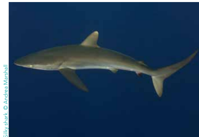
Silky shark.

The FAO expert advisory panel convened in 2016 to assess CITES proposals concerning commercially exploited aquatic species considered the silky shark as a “low productivity species” and determined that available information on status did not meet the Appendix II listing criteria. The panel found that, because only one data series (that for the southern Eastern Pacific Ocean) demonstrated a population decline that matched the listing criteria (if the most recent two years of data were not included), a CITES Appendix II listing would be “inconsistent with the proportionate risk to the species as a whole.” The panel noted several possible benefits of a properly implemented Appendix II listing, including better monitoring, reporting, and control of silky sharks entering international trade, which should help to ensure legal and sustainable sourcing, enable stock assessments and subsequent management, and complement existing fishery measures.